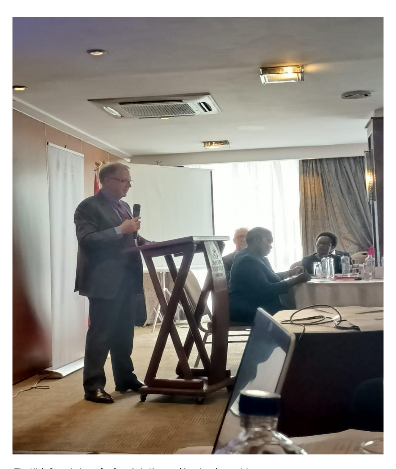
The High Commissioner for Canada in Kenya addressing the participants