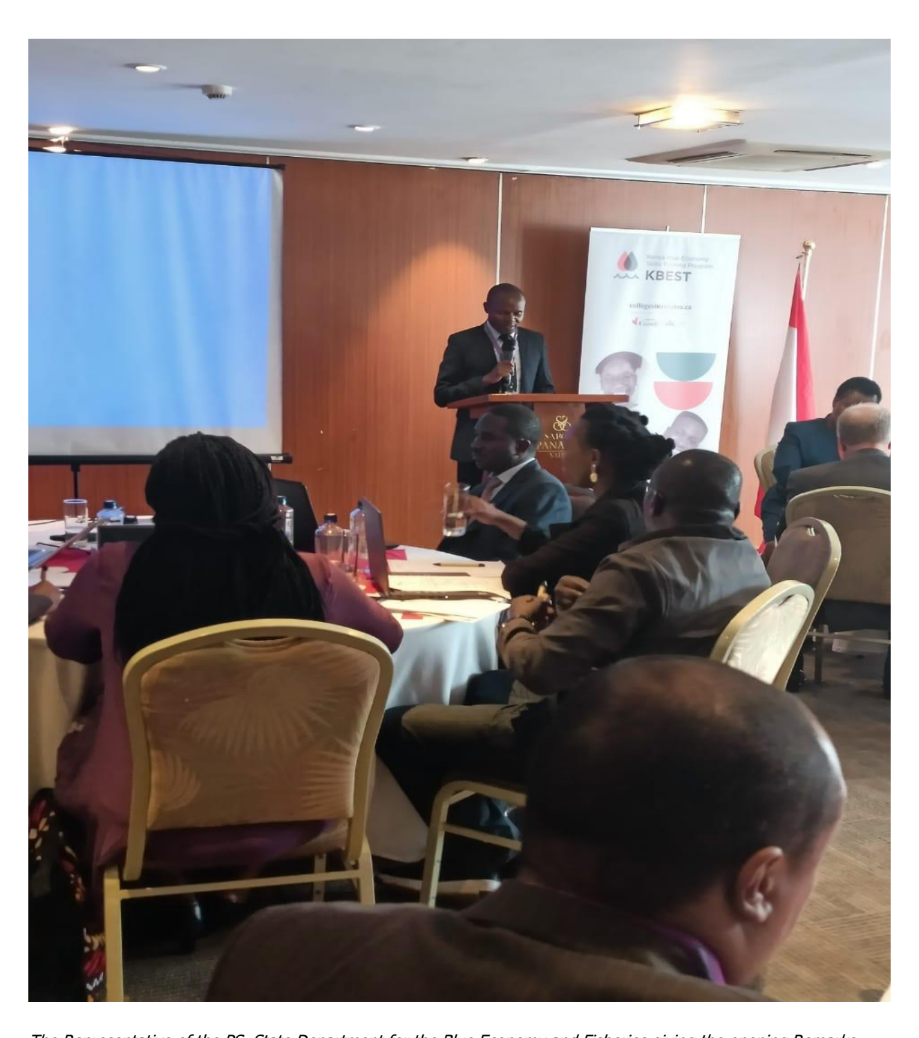
The Representative of the PS, State Department for the Blue Economy and Fisheries giving the opening Remarks